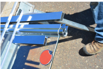
Install floor spacer for "fixed" edge.